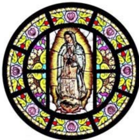
The 6' stain glass logo above is located in Our Lady of Guadalupe Church on the same property.